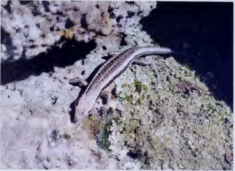
Fig. 2. Spencer's Skink Pseudemoia spenceri on heritage stone fence.